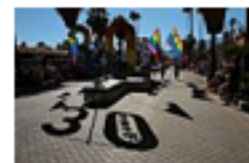
Palm Springs Pride Parade 2013