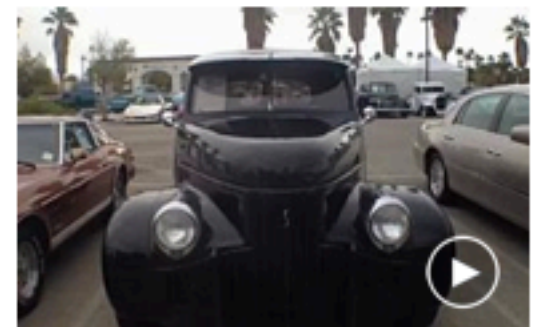
Classic cars galore in Palm Springs Nov. 22, 2013