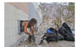
Homeless in Palm Springs